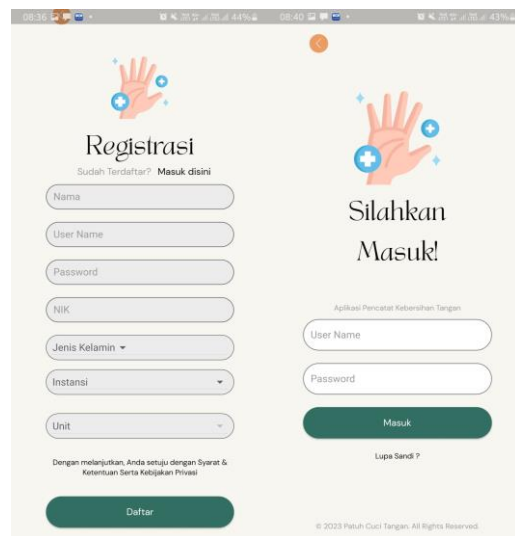
Picture 2. Register page and login page