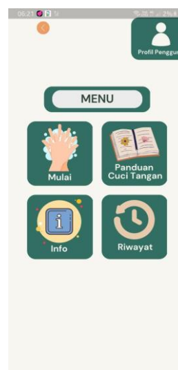
Picture 3. The mobile app menu

After logging in, a main menu containing some of the features available in this mobile application will be displayed. A "mulai" or start menu is used to start a session in observation. "Panduan cuci tangan," or washing hand guidelines, contains procedures for doing hand hygiene per applicable WHO standards. Menu "info" contains developer and affiliate information. Menu "riwayat" displays a history of observations that the observer has made.